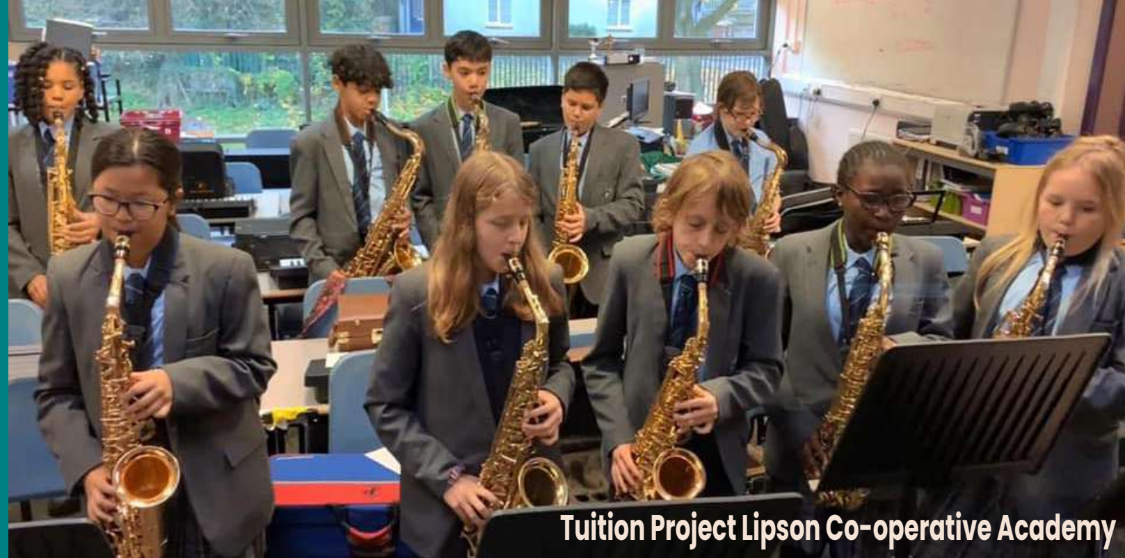
Tuition Project Lipson Co-operative Academy

PMA provides opportunities for young people to participate in and perform music, and to listen to live music in Plymouth